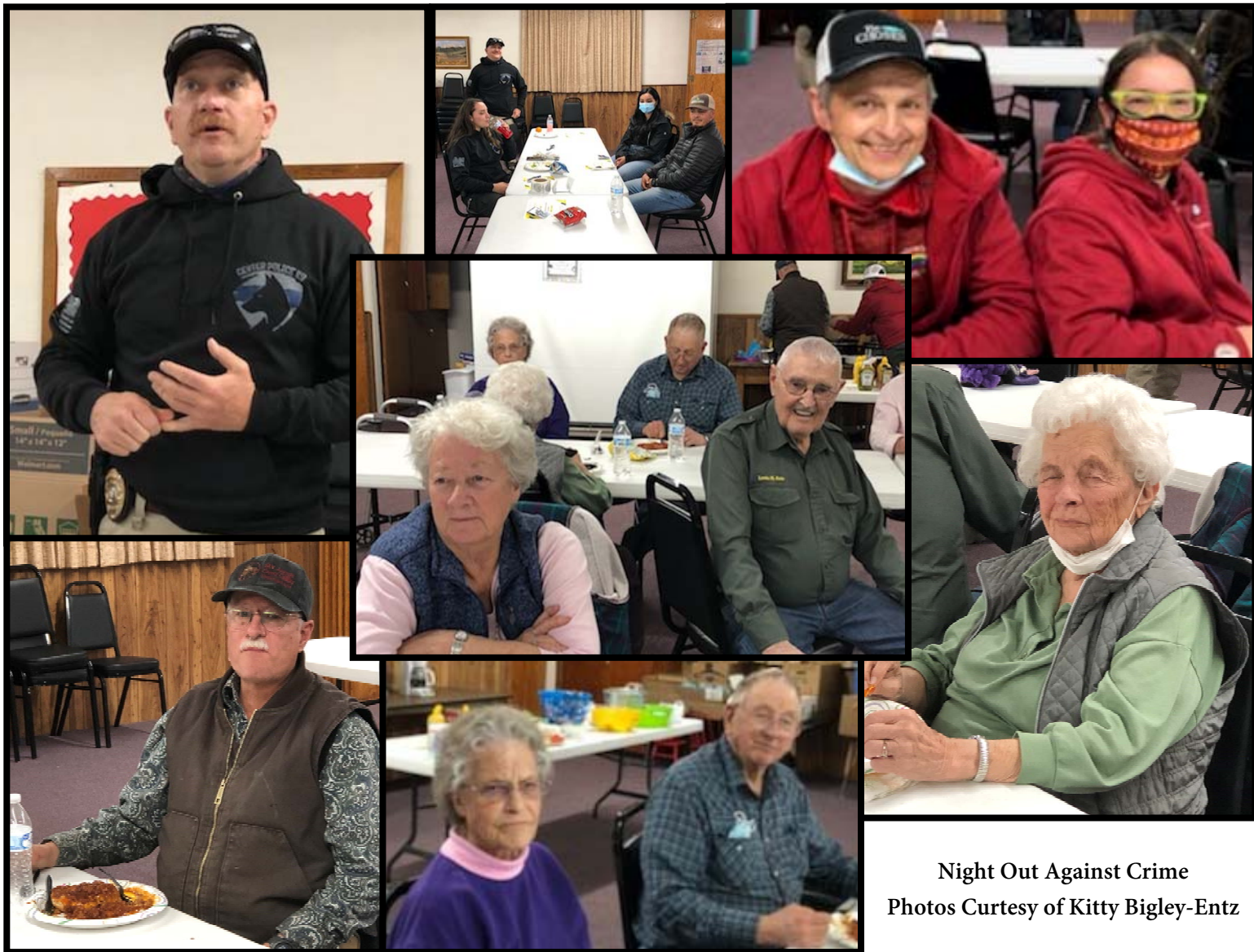
Night Out Against Crime

for more information and/or an application.