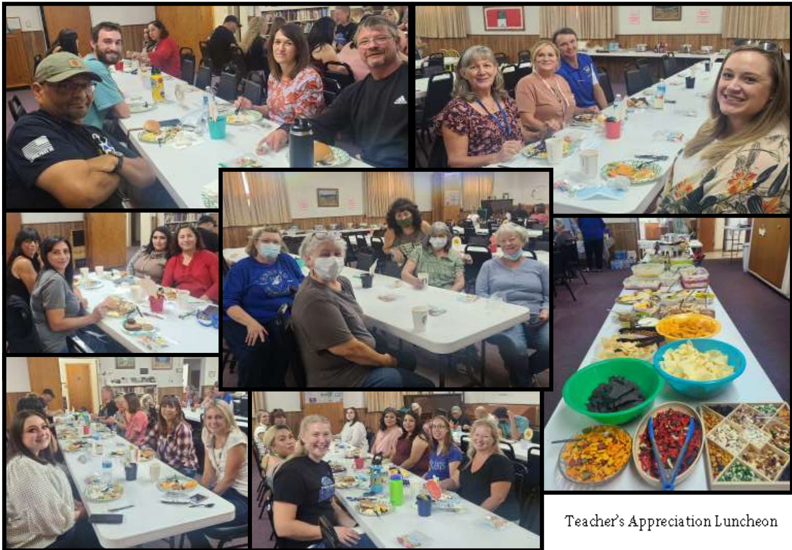
Teacher's Appreciation Luncheon

As I close this article, I would like to thank all of you who have faithfully supported your church's ministries with your time, talent, gifts, and offerings. Both Center and Saguache struggle as we continue to have saints who were faithful givers join the heavenly band, and those of us who remain are struggling to fill those financial holes. God hasn't brought us this far to leave us, but this is a time to reevaluate our priorities and listen to God's leading to tithe and even consider an offering above the tithe.